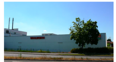
Norway Maple Tree, Damaged by Cell Antennas

Side facing the RF transmitter: 2,100 \mu\text{W}/\text{m}^2 Opposite side: 290 \mu\text{W}/\text{m}^2