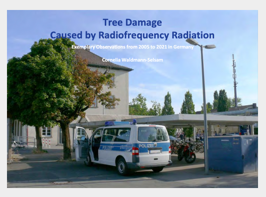
"Tree damage caused by mobile phone base stations 2021"

Sivani, S, and D. Sudarsanam. (2012): "Impacts of radio-frequency electromagnetic field (RF-EMF) from cell phone towers and wireless devices on biosystem and ecosystem-a review." Biology and Medicine 4, no. 4 202-216.