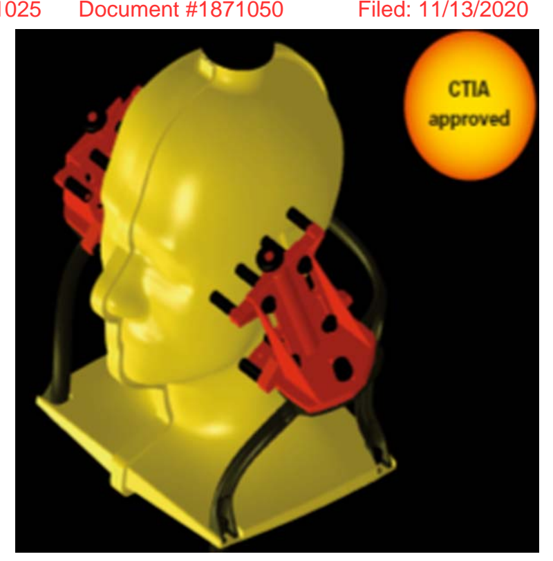
FIGURE 1 SAM Phantom. "CTIA" is Cellular Telecommunications Industry Association.

banana shaped sperm head. The occurrence of the sperm head abnormalities was also found to be dose dependent" (Otitoloju et al., 2010). The researchers reported sperm abnormalities at 489 mV/m (workplace), and 646 mV/m (residential) compared to exposure limits of 41,000 mV/m and 58,000 mV/m, respectively (ICNIRP, 1998).