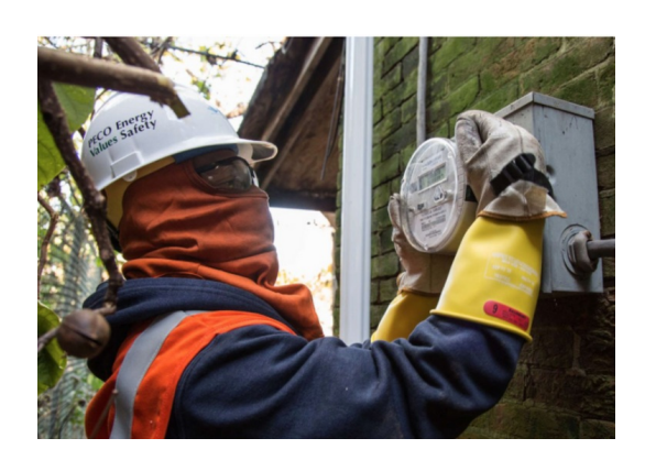
Major Win: Court Ruling on Pennsylvania Smart-meters