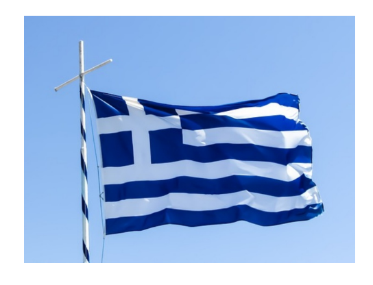
Greece: Experts Launch Stop 5G Petition to Supreme Court

In the press release of the petition signed by citizens "from almost every part of Greece," experts detail the potential adverse health effects and environmental impacts of 5G.