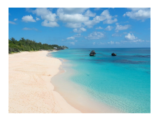
Bermuda's Moratorium on 5G Draws International Experts Bermuda has halted 5G and

Until November 30th, the registration price for students and people not seeking Continuing Medical Education (CME) is only $149. For attendees seeking CME the price is $349. Please share this conference announcement widely, especially with medical doctors and health practitioners. LINK