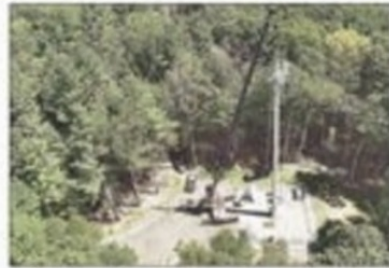
An aerial view of the 115-foot monopole that Verizon Wireless erected in a south Pittsfield neighborhood in 2020.