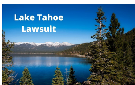
Lake Tahoe Lawsuit

Read the California Green Party Statement on 5G Wireless