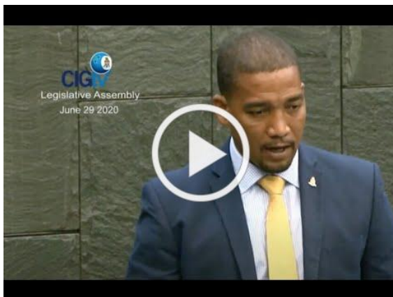
5G Health Effects at Cayman Islands Legislative Session

Please share the most recent one minute public service announcement comparing 5G to lead, tobacco and DDT HERE . Also remember to subscribe to our Youtube channel so you never miss a video.