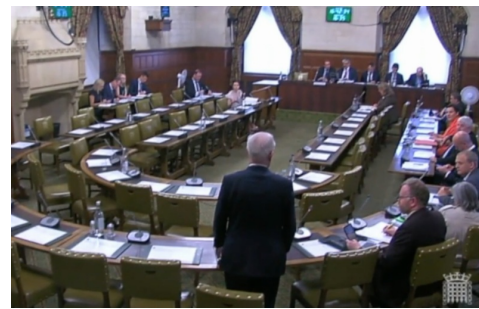
UK House of Commons Debate on Health Effects of 5G and Wireless