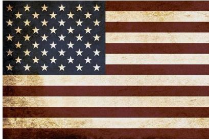
US Government Reports on Electromagnetic Fields