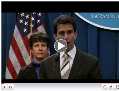
"Cell Phones have health effects" -Senator Jay Leno in 2010

lead to the 2004 Firefighters Union Official Position Against Cell Towers on Fire stations. Read More