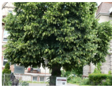
Tree Damage Caused by Base Stations by Helmut Breunig