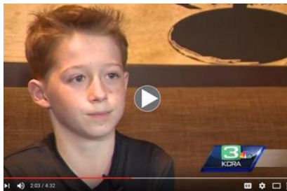
Students Develop Cancer at School with Cell Tower