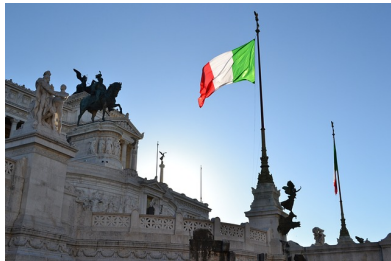
Italy Issues Decree To Reduce EMF & Prefer Wires Over Wi-Fi

DONATIONS MADE AUGUST 1ST THROUGH SEPTEMBER 15TH, 2017 WILL BE MATCHED RACE DAY IS SATURDAY SEPTEMBER 9, 2017 • 10:00 AM