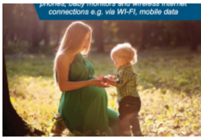
Cyprus: New Brochure To Reduce Cellular/WiFi