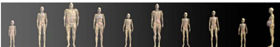
FIGURE 3 The Virtual Family. http://www.itis.ethz.ch/services/population-and-animal-models/population-models/ (accessed December 10, 2010).

Because any head size smaller than SAM receives a larger SAR, children receive the largest SAR relative to adults modeled with the SAM process. Gandhi et al. (1996) reported that for 5- and 10-year old children, using only head size differences compared to an adult, the children’s SAR was 153% higher than adults. Wiart et al. (2008) employed MRI scans of children between 5 and 8 years of age and found approximately 2 times higher SAR in children compared to adults, and Kuster et al. (2009) reported that the peak SAR of children’s CNS tissues is “significantly larger (~2x) because the RF source is closer and skin and bone layers are thinner.” de Salles et al. (2006), using scans of a 10-year old boy’s head with children’s electrical tissue parameters found that differences in head size and other parameters increased the SAR by 60% compared to an adult. Peyman et al. (2001) found the relative permittivity of an adult brain was around 40 while a young child’s brain is from 60–80, resulting in a child’s SAR being 50–100% higher than an adult’s independent of head size. Han et al. (2010) provided additional analyses of the underestimation of spatial peak SAR with the SAM process.