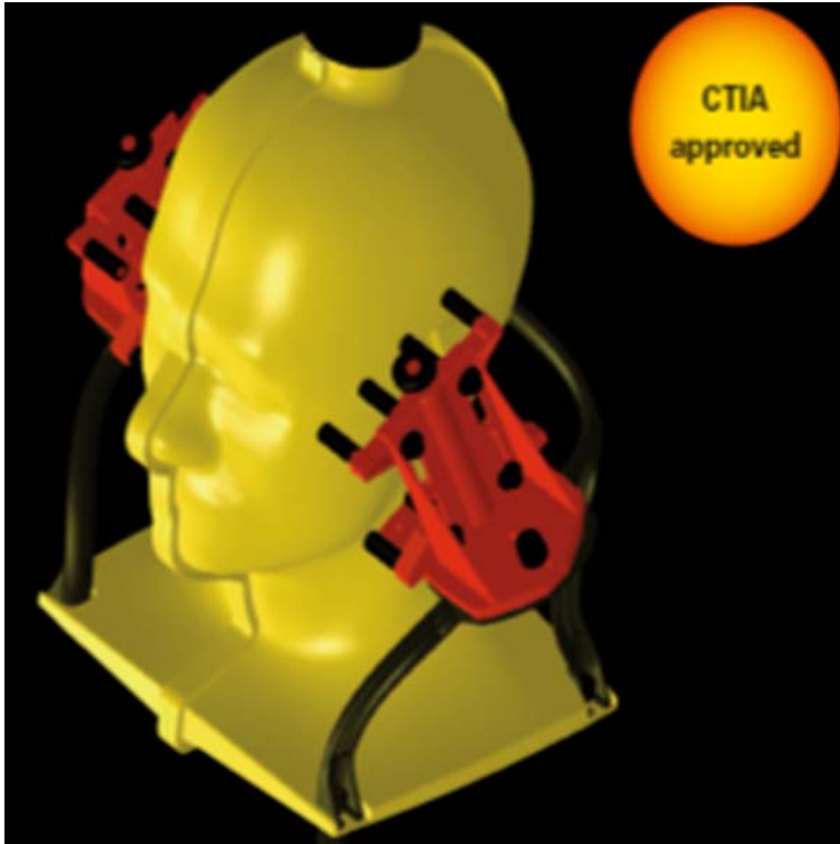
FIGURE 1 SAM Phantom. “CTIA” is Cellular Telecommunications Industry Association.

banana shaped sperm head. The occurrence of the sperm head abnormalities was also found to be dose dependent” (Otitolaju et al., 2010). The researchers reported sperm abnormalities at 489 mV/m (workplace), and 646 mV/m (residential) compared to exposure limits of 41,000 mV/m and 58,000 mV/m, respectively (ICNIRP, 1998).