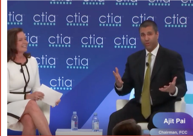
Telecom Industry Influences Science on 5G & Cell Phones

Your Support Allows Us To Do This Work: Click Here to Donate.