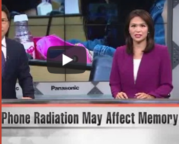
Memory Damage in Teens from Cell Phone Radiation