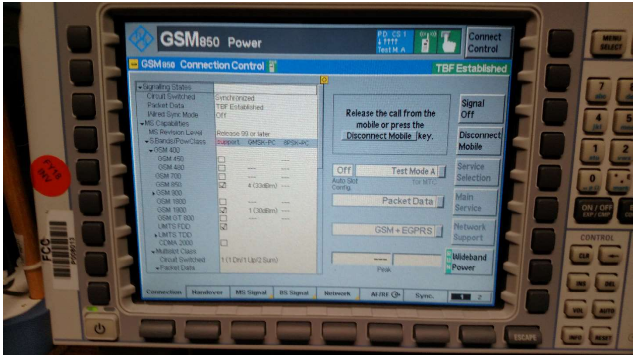
Figure 2: Connection Control Screen of CMU 200