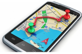
Virtual GLORE 2020 November 9-12, 2020