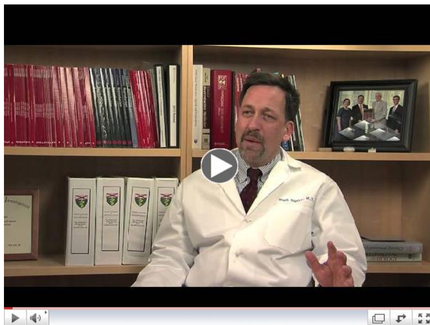
The Science of Exposure - Wireless Radiation

EHT needs your help to complete our infant and toddler brain modeling study to learn the true levels of radiation that young children absorb from wireless devices. Although millions of young children are using devices today, nobody can tell us what this may mean for their health. Learn More about what it means to be a volunteer.