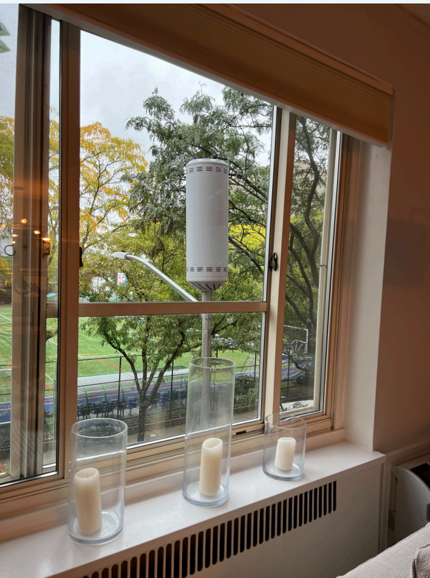
Cell antennas in front of New York City living room window.