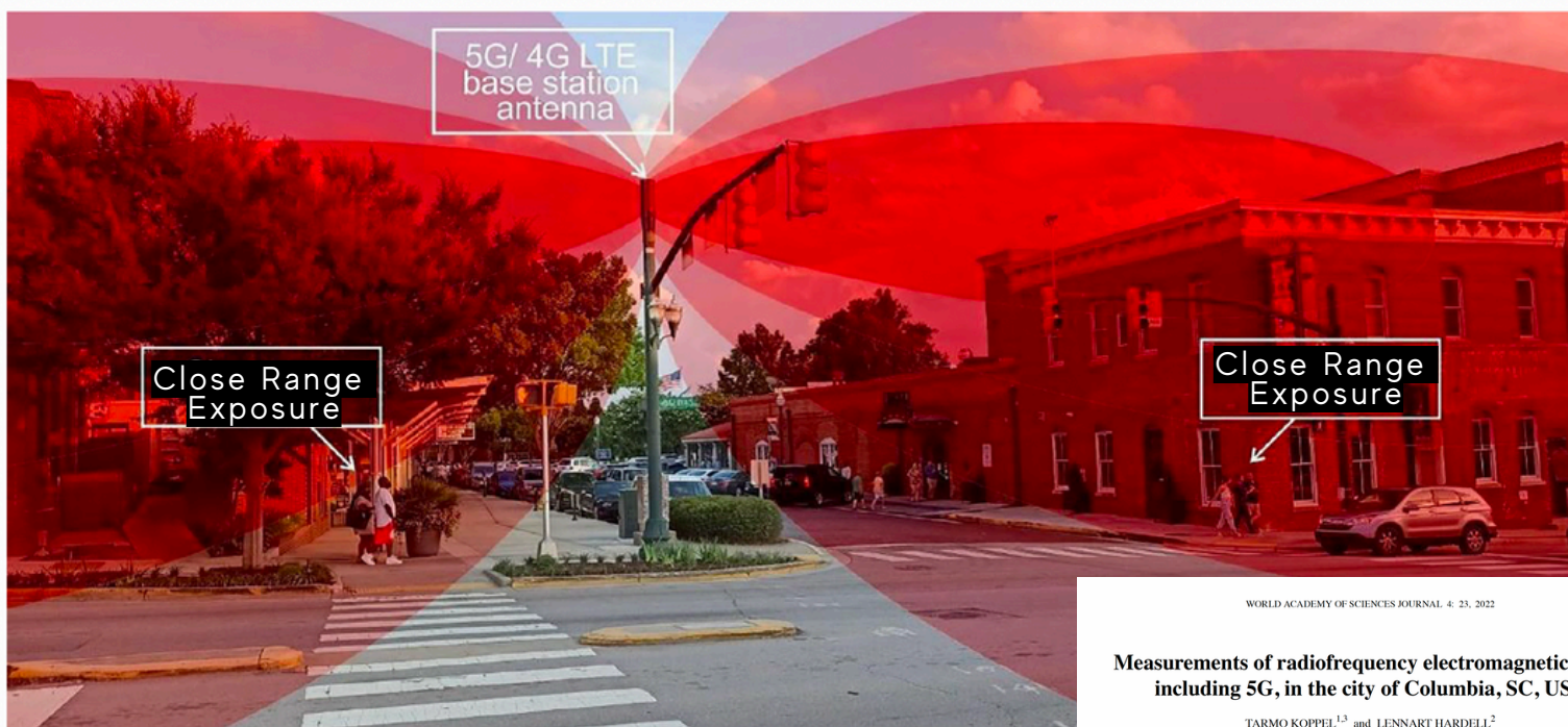
Figure 7. Gervais Street: Cell phone base station antenna placed close to street level and causing high exposure to pedestrians and nearby café visitors (exposure scenario illustration). The antenna appears camouflaged and seemingly part of a utility pole. The measurer only discovered the antenna due to the high radiofrequency levels in the vicinity.

The researchers concluded that the highest exposure areas were due to two reasons: cell phone base antennas on top of high-rise buildings provide "good cell coverage reaching far away, but creating elevated exposure to the radiofrequency electromagnetic fields at the immediate vicinity; and cell phone base station antennas installed on top of utility poles have placed the radiation source closer to humans walking on street level."