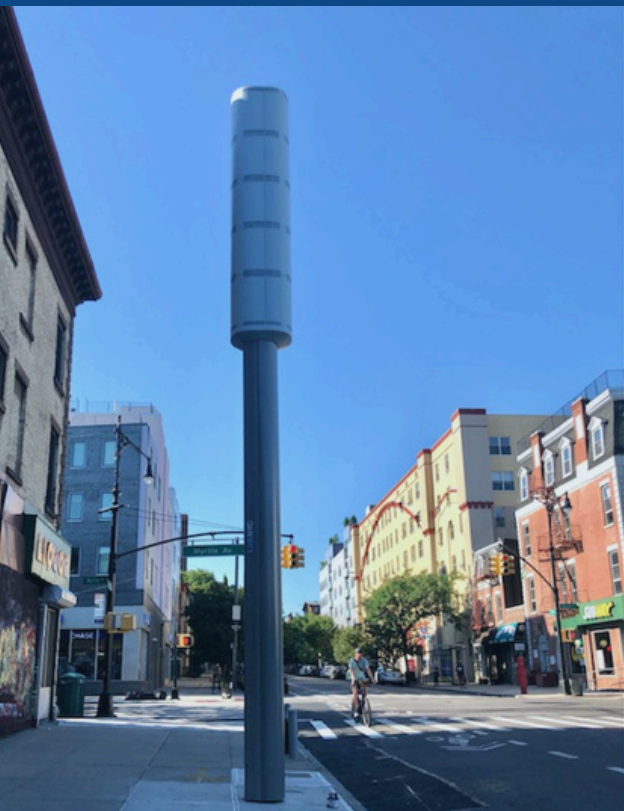
New York City Jumbo 5G poles with 5 tiers to house transmitting antennas from numerous carriers.