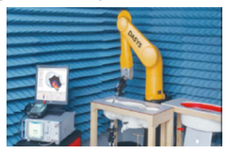
FIGURE 2 Robotic arm with electric field probe.

For the computer simulation certification process, the revised FCC Supplement C publication states, "Currently, the finite-difference time-domain (FDTD) algorithm is the most widely accepted computational method for SAR modeling. This method adapts very well to the tissue models that are usually derived from MRI or CT scans such as those currently used by many research institutions. The FDTD method offers great flexibility in modeling the inhomogeneous structures of anatomical tissues and organs (Means and Chan, 2001, p. 13)."