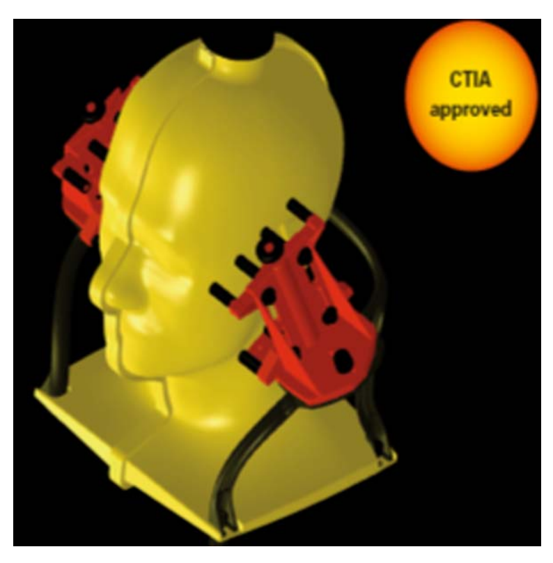
FIGURE 1 SAM Phantom. "CTIA" is Cellular Telecommunications Industry Association.

banana shaped sperm head. The occurrence of the sperm head abnormalities was also found to be dose dependent" (Otitoloju et al., 2010). The researchers reported sperm abnormalities at 489 mV/m (workplace), and 646 mV/m (residential) compared to exposure limits of 41,000 mV/m and 58,000 mV/m, respectively (ICNIRP, 1998).