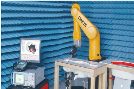
Robotic arm with electric field probe